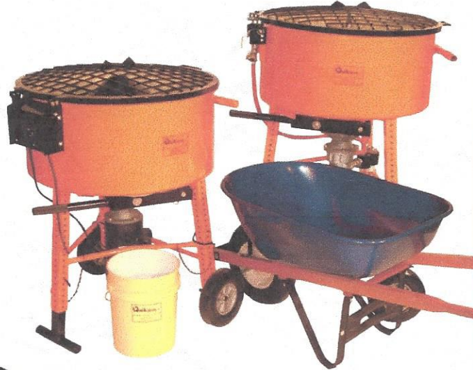
Variable Height Adjustment