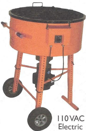
110 VAC Electric