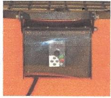
220 VAC Remote Variable Speed